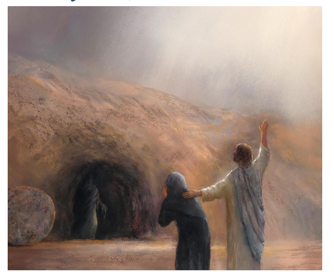
March 25h and 26th, 2023 5th Sunday of Lent

Lenten Holy Mass Schedule Tuesday: 6:30pm Wednesday: 9am Thursday: 12:10pm Friday: 7pm Saturday Liturgy: 5pm Sunday Liturgy: 10am Reconciliation: Tuesday - 5:30pm to 6:30pm Sacrament of Anointing: Contact the Pastor 8