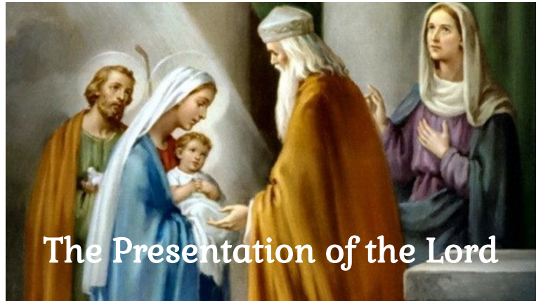
The Presentation of the Lord