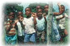
...an organization of CHILDREN helping CHILDREN.

The Holy Childhood Association (HCA) is designed for Catholic Children so they can help other children around the world. The HCA helps children in Ghana, India, Kenya, Tanzania, Uganda and Sri Lanka. Children Helping Children is a project for children in our parishes and many schools! No one is too little to care about others. What can you do this week? Use the Lenten calendar that was in the last bulletin. Help your family make a Lenten Chain! Cut purple construction paper into one-inch horizontal strips. Once a week, during Lent, invite everyone in your family to write down their Lenten goal for the week: a prayer they plan to say each day, a sacrifice they plan to commit to, a work of mercy they plan to perform, etc. Loop the strips around one another, taping them together to form a chain. Display the Lenten Chain prominently and watch it grow during Lent as the family strives to grow closer to Jesus.