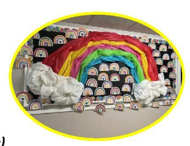
Dominic Place (Central Office)